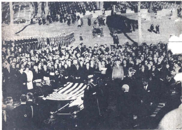
Burial services at Arlington . . .