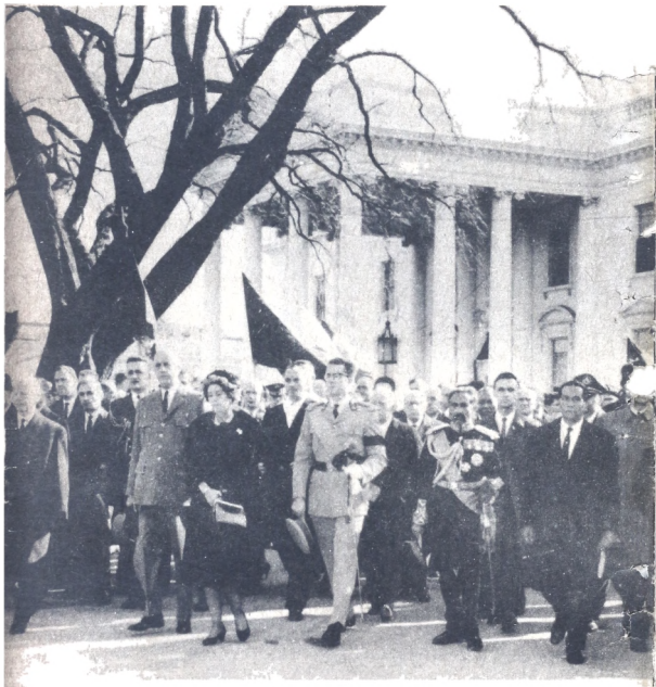
Distinguished mourners leave White House . . .