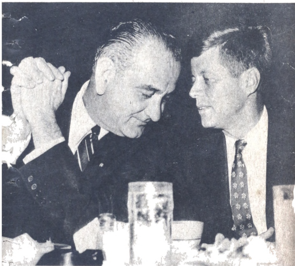
Kennedy and his successor Johnson . . .