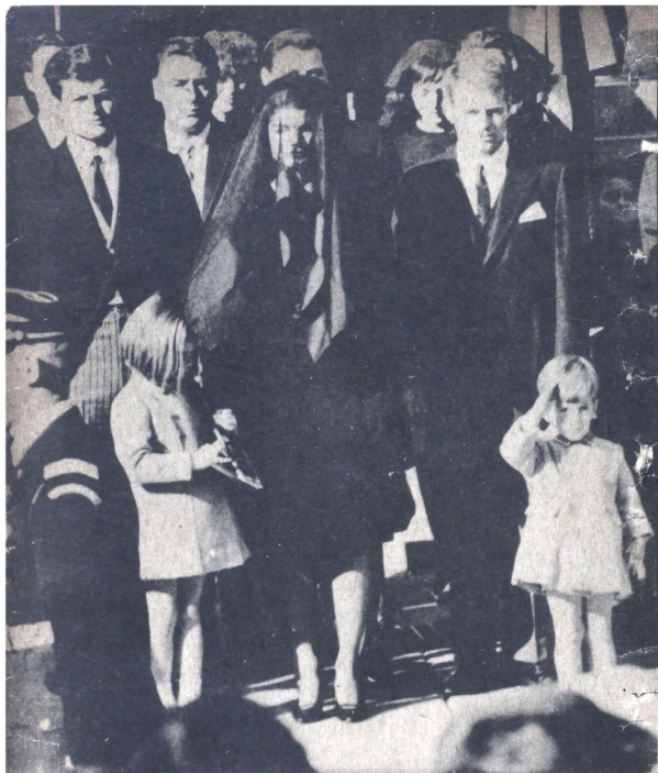
John-John salutes his Dad's remains . . .