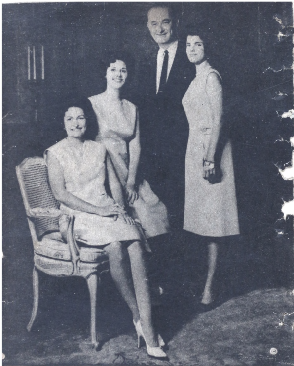
America's New First Family — The LBJ's of Texas.