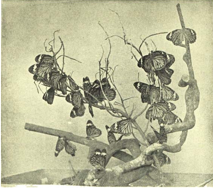
AN ASSEMBLY OF PHILIPPINE MONARCH BUTTERFLIES observed by the USC 1959 Palawan expedition. Many other local butterflies show this social habit thru mud-puddle congregations where several species are seen together by the hundreds.