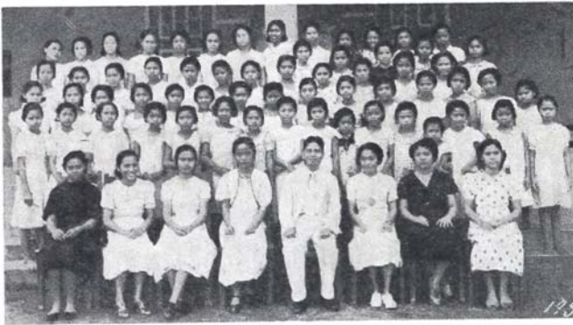
Members of the Polangui (Albay) Junior Woman's Club.