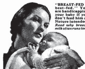
"BREAST-FED is best-fed." You are handicapping your baby if you don't feed him as Nature intended. Read why breast-milk often runs low.

Often—a simple addition to mother's diet is all that's needed to increase supply