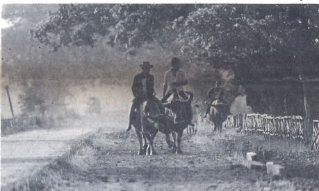
New budget for infrastructures (P18.3 billion) means more farm-to-market roads.