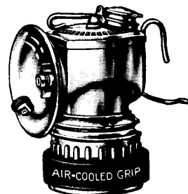
No. 807 Cap Lamp the new streamlined type; 2-1/2 hours of efficient light on one 2-ounce charge